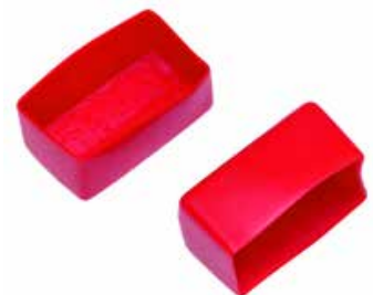
Part.#: 1320 C-Profile End Caps