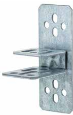
Part.#: 1311 C-Profile Bracket V, vertical