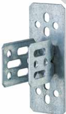
Part.#: 1310 C-Profile Bracket H, horizontal